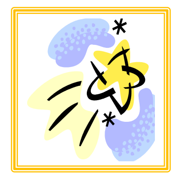
Pike Fold Community School Upper KS2 Newsletter